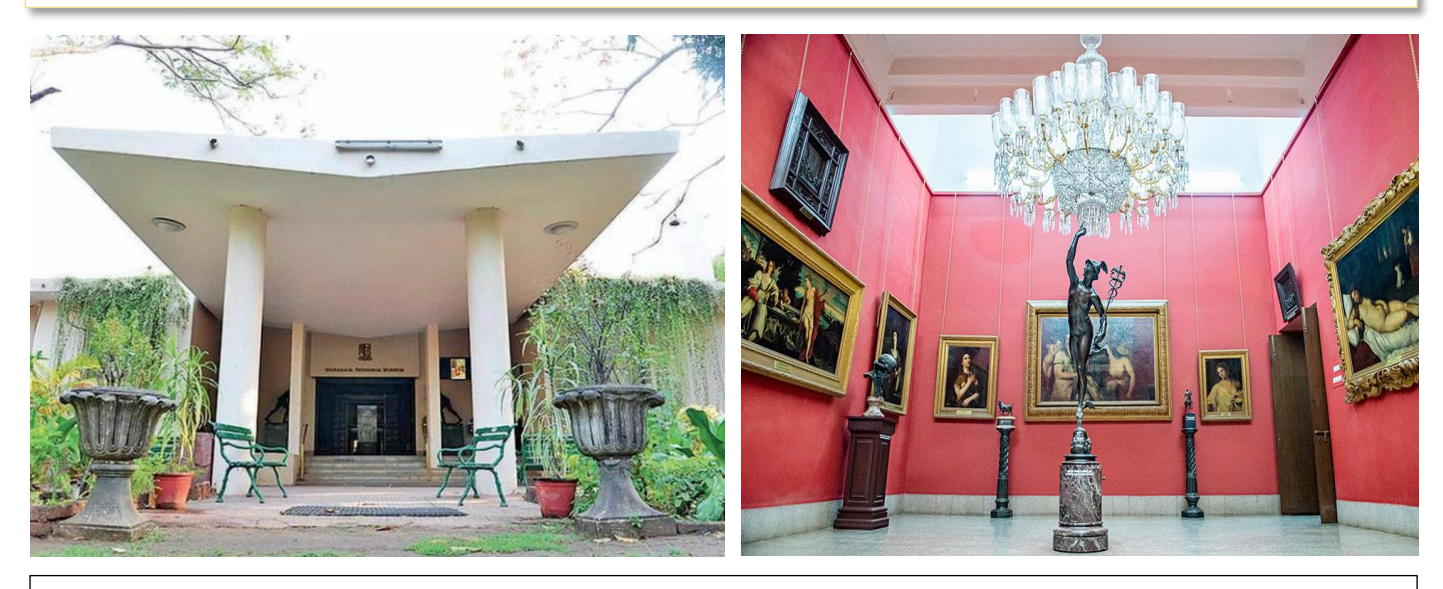
Maharaja Fatehsing Museum