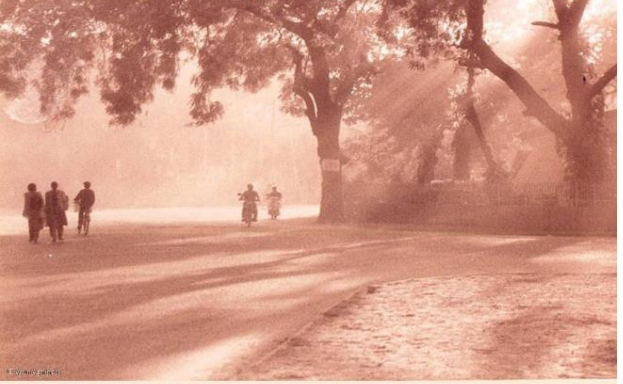
Believe it or not, but this is Pratapgunj in the mid-Eighties