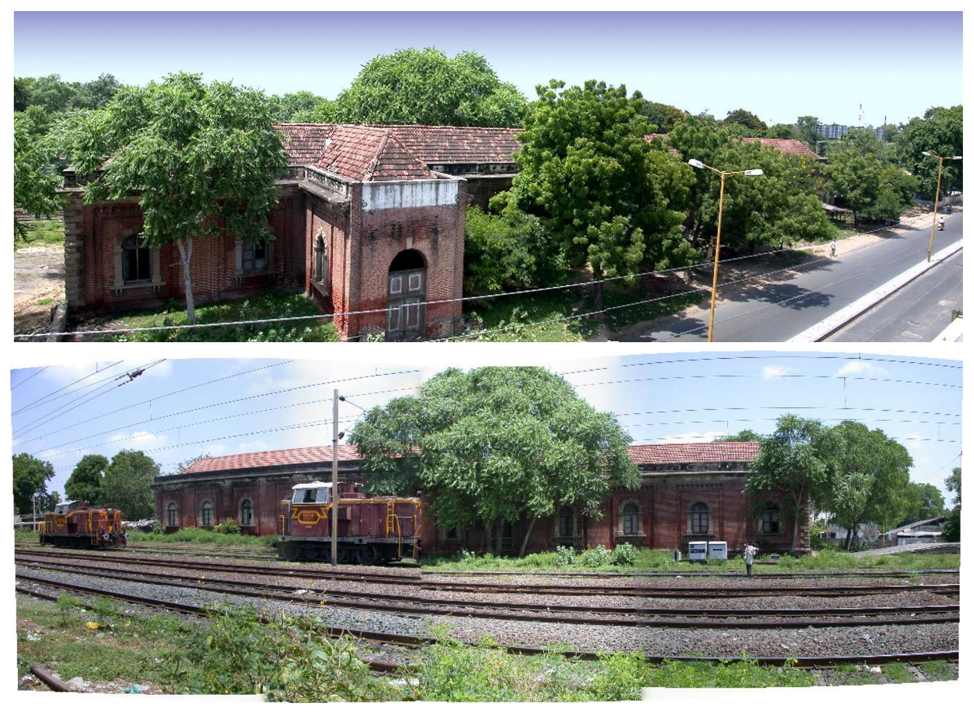
The east (road side) and west (rail line side) facades of the Railway Saloon in early 2000.

The Railway Saloon, a linear exposed brick building built in the 1880's, once acted as the shed for royal saloons or luxurious boogie's/coaches of the Gaekwads. It boasted of regularly placed round arched windows framed by rough stone sills and brackets. Stone quoins at the corners of the walls added to its strong yet elegant persona. The pitched hip roof once rested on huge steel trusses and purlins, which on the inside would have been covered by wood battens inside. The building was accessible from its shorter ends, i.e. north-west and south east side, via arched entrances, making it comfortable even in hot summer conditions. It would also have had a small porch on the road side (east) for exit onto forward journey for the king and his family.