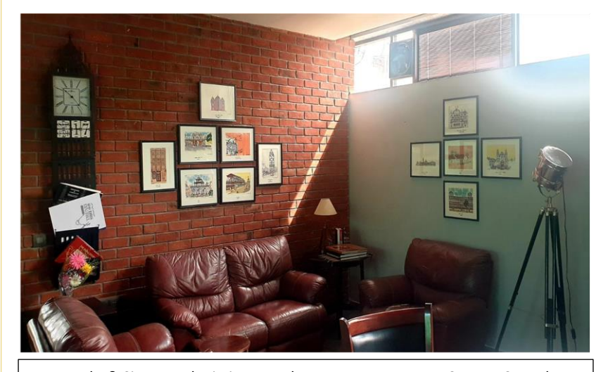
Art Works & Signages depicting Baroda Monuments