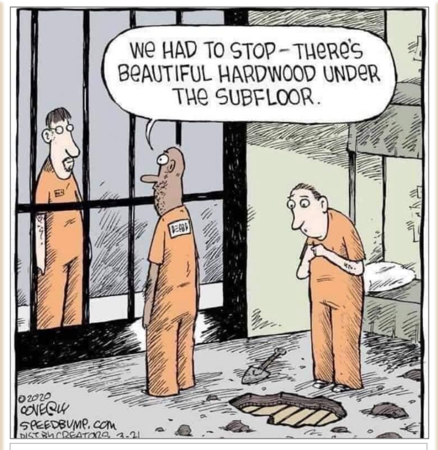
Humor: Trying to get to the bottom of it