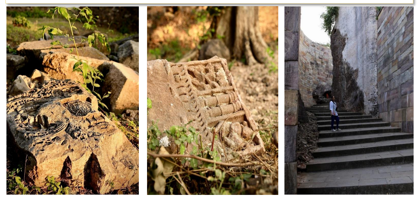
Rubble from Ruins littering the Forest Floors

With the sun following us, we went from one awe-inspiring monument to another, covering mosques, step-wells, and fortifications. We spent many delightful moments just watching trucks,