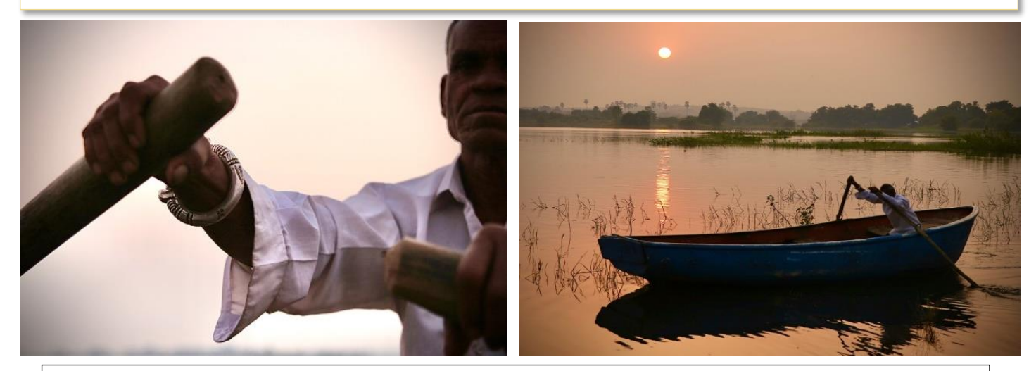
Top: Sunset @ Bhamaria, Bottom: Boatman with Silver bracelets

The hillside is strewn with monuments from the time of the Muslim rule of Sultan Mehmud Begda and earlier Hindu rulers, notably the Khichi Chauhan Rajputs. At the very top is the revered temple of Kalimata, attracting hordes of worshippers from all over. We did not visit the temple as the cable cars ferrying people to the temple were quite crowded. We meandered around the ruins, just below the jump off point for the cable cars. And discovered that we could have actually walked up the hill along a sheltered walkway that no one seemed to use.